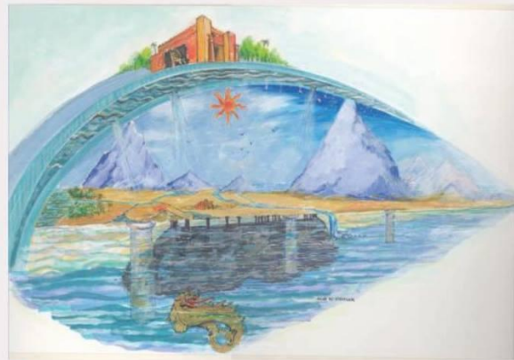
Image depicts modern artistic reconstruction of an ancient Israelite view of the cosmos. The sky, supported by mountains at the edges, holds back the waters above as it arches over the flat, disk-shaped earth, which is upheld by pillars.

Old Testament reflects this cosmic geography, and discussions of creation are based on this understanding.