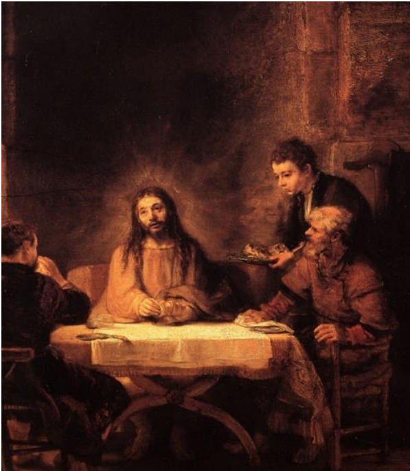
Dinner in Emmaus with Jesus

Blessed are you Lord our God, king of the universe, who has taken us to be Your people.